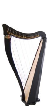
Ravenna 26 34 strings, A - C £2150 Inc VAT

To make an enquiry about hiring an instrument, you may contact us by phone (01367 860 493), email or general enquiry form.