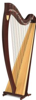
Ogden 34 34 strings, A - C £3700 Inc VAT