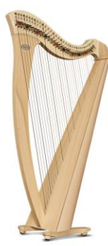
Mia 34 38 strings, A - C £2625 Inc VAT