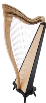
Ravenna 34 34 strings, A - C £3200 Inc VAT