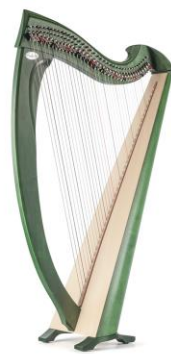
Una 38 38 strings, C - C £3770 Inc VAT